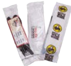
Overwrap Film (up to 4 colours)