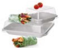
Eco-Products™ WorldView™ Take-out Round, Rectangular and Square Containers (all sizes)