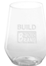
Stemless Glass (size 14oz) MOQ - 20 Cases