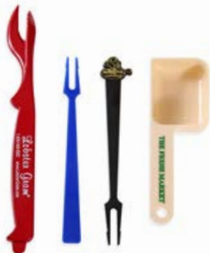
Standard & Custom Shaped Products Print MOQ - 5,000 pieces Molded MOQ - 50,000 pieces (25,000 pieces for repeat orders)