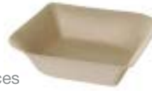
Eco-Products™ Dahlia™ Bowl (sizes 12oz) MOQ - 100,000 Pieces