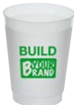
Frost-Flex® Tumblers (sizes 5oz to 24oz) MOQ - 15,000 Pieces