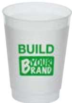
Frost-Flex® (sizes 5oz to 24oz) MOQ - 25,000 Pieces