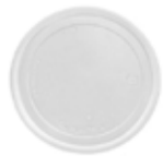
Eco-Products™ Deli and Portion Cup Lids (sizes 2oz to 32oz)