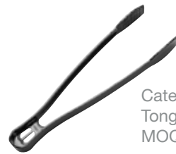
CaterLine™ Tongs 9" MOQ - 30 Cases