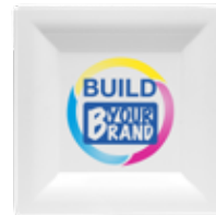
Milan™ Grand™ Square Plate (sizes 6.5", 9.5") MOQ - 300 Pieces