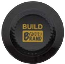
Masterpiece™ Round Plate (sizes 6", 7.5", 9", 10.25") MOQ - 300 Pieces