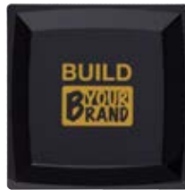
Milan™ Square Plate (sizes 5.375", 6.75", 8.25", 9.25") MOQ - 300 Pieces