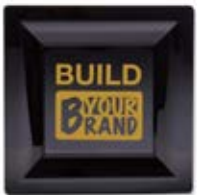
Milan™ Grand™ Square Plate (sizes 6.5", 9.5") MOQ - 300 Pieces