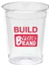
Comet™ (sizes 1oz to 12oz) MOQ - 25,000 Pieces