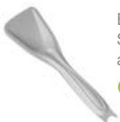
Eco-Products™ Serving Spoon and Spatula 10"