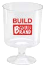
Classicware™ (sizes 2oz to 8oz) MOQ - 25,000 Pieces