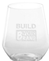
Stemless Glass (size 12oz) MOQ - 20 Cases