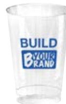
Classicware® (sizes 8oz to 16oz) MOQ - 25,000 Pieces