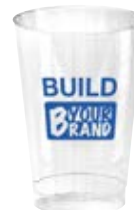
Classicware® (sizes 8oz to 16oz) MOQ - 25,000 Pieces