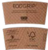
Eco-Products™ BlueStripe™ EcoGrip™ Hot Cup Sleeve (up to 2 colours) MOQ - 40 Cases