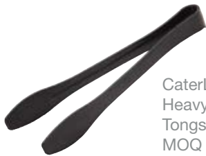
CaterLine™ Heavy-Duty Tongs 9" MOQ - 30 Cases