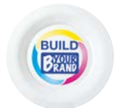
Milan™ Round Plate (sizes 6.75", 9.25") MOQ - 300 Pieces