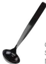
CaterLine™ Small Ladle 9" MOQ - 30 Cases