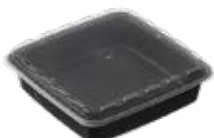
Square Cube Deli Microwavable and Take-Out Containers Lid Only MOQ - 500 Cases