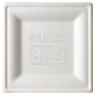
Eco-Products™ Sugarcane Plates (sizes 6", 8", 10", 10" x 5") MOQ - 100,000 Pieces