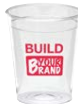
Comet™ Rigid Tumblers (sizes 1oz to 16oz) MOQ - 15,000 Pieces