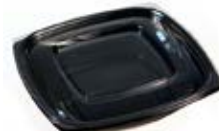
POLAR PAK® Combo and Hinged Containers. Dome and Flat Lids Only Centre Print Only Contact Account Manager for Minimum Order Quantity