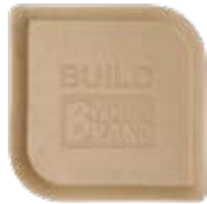
Eco-Products™ Dahlia™ Plates (sizes 6", 9") MOQ - 100,000 Pieces