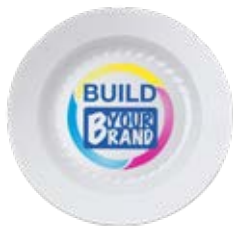
Masterpiece™ Round Plate (sizes 7.5", 10.25") MOQ - 300 Pieces