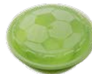
Round Cube Deli Microwavable and Take-Out Containers Lid Only MOQ - 500 Cases