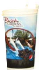
Memorables™ Souvenir Cups (sizes 12oz to 64oz) MOQ - 5,000 Pieces