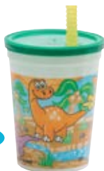
Kids FunCups™ (size 12oz only) MOQ - 5,000 Pieces