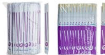
Touch™ Chopsticks envelope (sealed and open) (up to 4 colours or CMYK) MOQ - 250 Cases