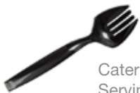
CaterLine™ Serving Fork 9" MOQ - 20 Cases