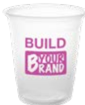
Pro-Flex™ Soft Sided Cups (sizes 12oz to 20oz) (available in white and clear cups) MOQ - 15,000 Pieces