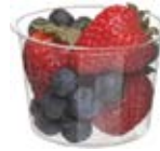
Eco-Products™ Portion Cups (sizes 2oz to 4oz)