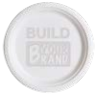
Eco-Products™ Sugarcane Plates (sizes 6", 7", 9", 10") MOQ - 100,000 Pieces