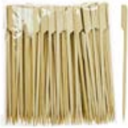
Touch™ Paddle Skewers Heat Stamped 1 side MOQ - 250 Cases