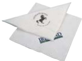
Napkins (1 or 2 Ply) (up to 4 colours)